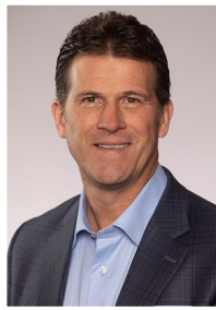
STEVE ALFORD BASKETBALL (M)