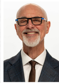
KIRK ELIAS CROSS COUNTRY (M & W)