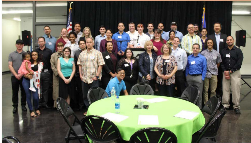
Jacobs Presidential Scholars Reception – April 28, 2018

The Foundation continues to make scholarship support for our students a top priority. In FY 2018, the Foundation raised $576,905 in support of annual scholarships and endowments. Actual scholarships awarded in FY 2018 totaled $734,984, which is another record year for the Foundation. A total of 696 scholarship awards were distributed to 558 students, which is a 20% increase in the number of students who were awarded from the previous year.