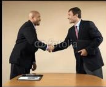
What my mom thinks I do