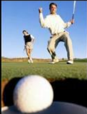
What clients think I do