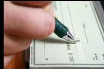
What politicians think I do