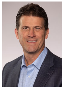
STEVE ALFORD BASKETBALL (M)