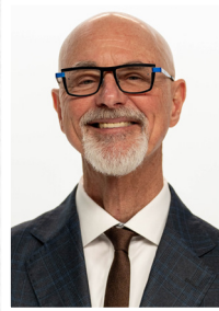
KIRK ELIAS CROSS COUNTRY (M & W)