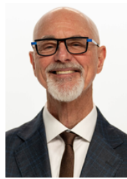
KIRK ELIAS CROSS COUNTRY (M & W)