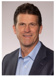
STEVE ALFORD BASKETBALL (M)